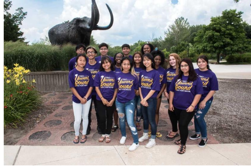
JUNIORS CLASS OF 2020