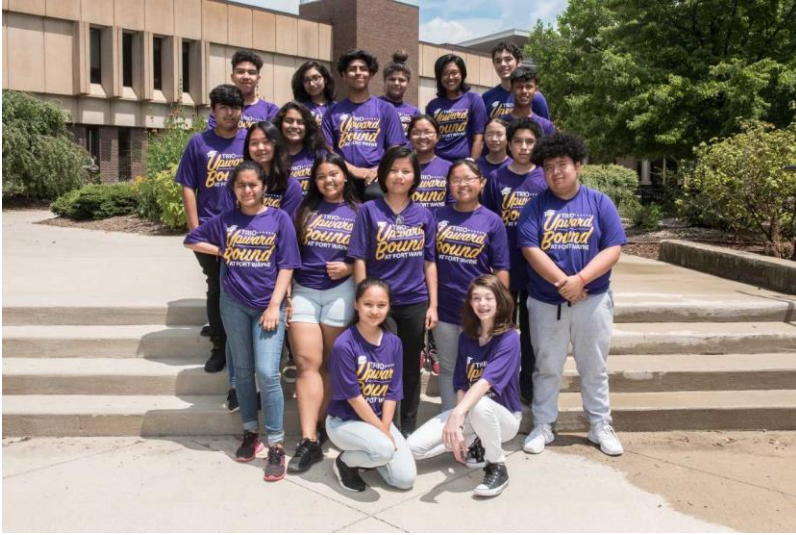
SOPHOMORES CLASS OF 2021